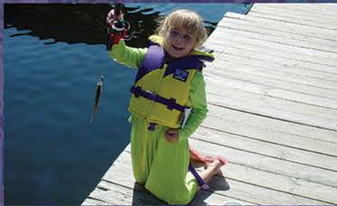
Kids love to dock fish for perch. Watch out for our pet northern however!