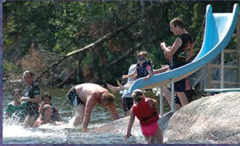
The swimming rock is always a popular spot on warm summer days.