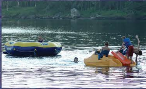
The canoe and paddle boat are always available for no charge.