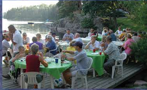
Don't miss Tuesday night fish fry at the dock. All you need to bring are your fish stories.