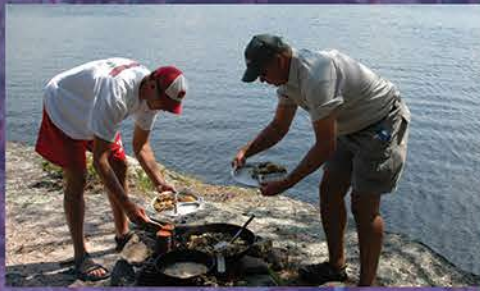
Make sure you enjoy at least one shorelunch on your vacation. It's a Canadian tradition.